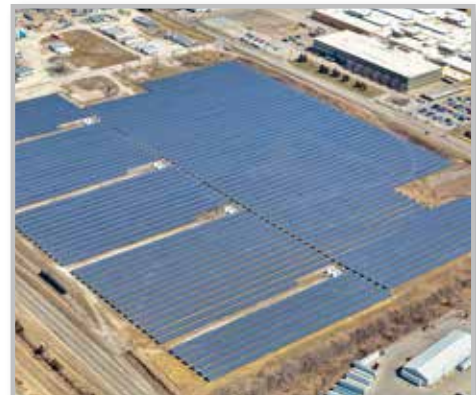
Formerly idle land owned by Vertellus is the site of a 43-acre solar farm