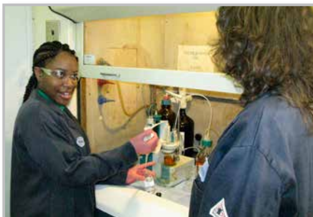
Vertellus team members give back to local communities by contributing their time, talents and funding.